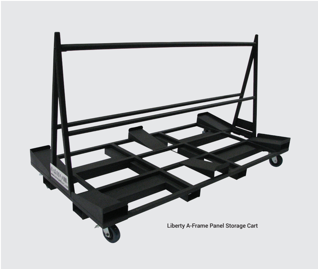
Liberty A-Frame Panel Storage Cart

Store up to 20 full size (96"x 48") Harlequin Liberty and Harlequin Liberty LatchLoc panels.