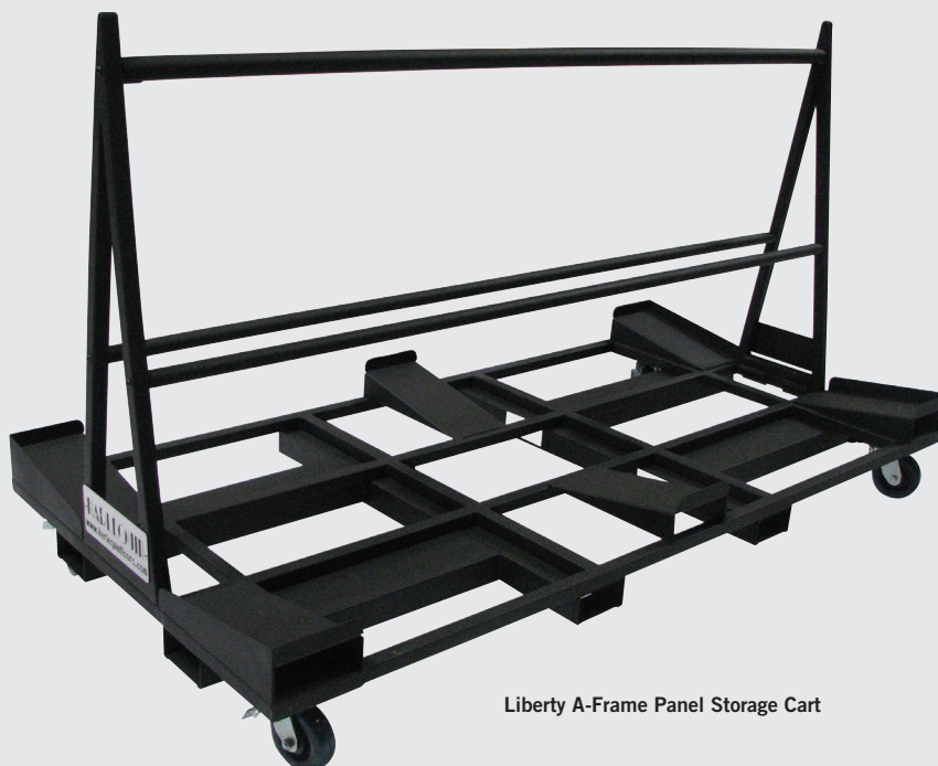
Liberty A-Frame Panel Storage Cart

Store up to 20 full size (96"x 48") Harlequin Liberty and Harlequin Liberty LatchLoc panels.